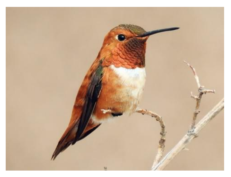
Rufous Hummingbird – Follett, Spencer, 2017, Adult male, The Cornell Lab of Ornithology, Ithaca, New York, accessed 15 March 2021,

https://www.allaboutbirds.org/guide/Rufous Hummingbird/media-browser-overview/68934031