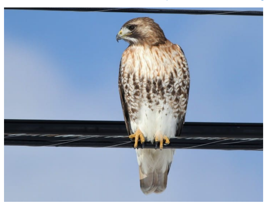
Red-tailed Hawk – Lamoreaux, Alex, 2016, Adult (borealis), The Cornell Lab of Ornithology, Ithaca, New York, accessed 15 March 2021, <a href="https://www.allaboutbirds.org/guide/Red-tailed-Hawk/media-browser-overview/60384771">https://www.allaboutbirds.org/guide/Red-tailed-Hawk/media-browser-overview/60384771</a>