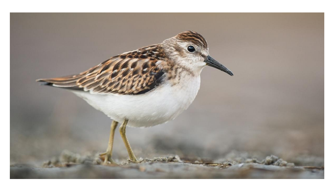
Least Sandpiper