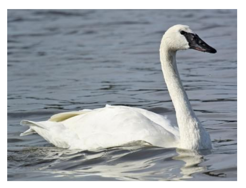
Trumpeter Swan

https://www.allaboutbirds.org/guide/Trumpeter_Swan/media-browser-overview/59954771