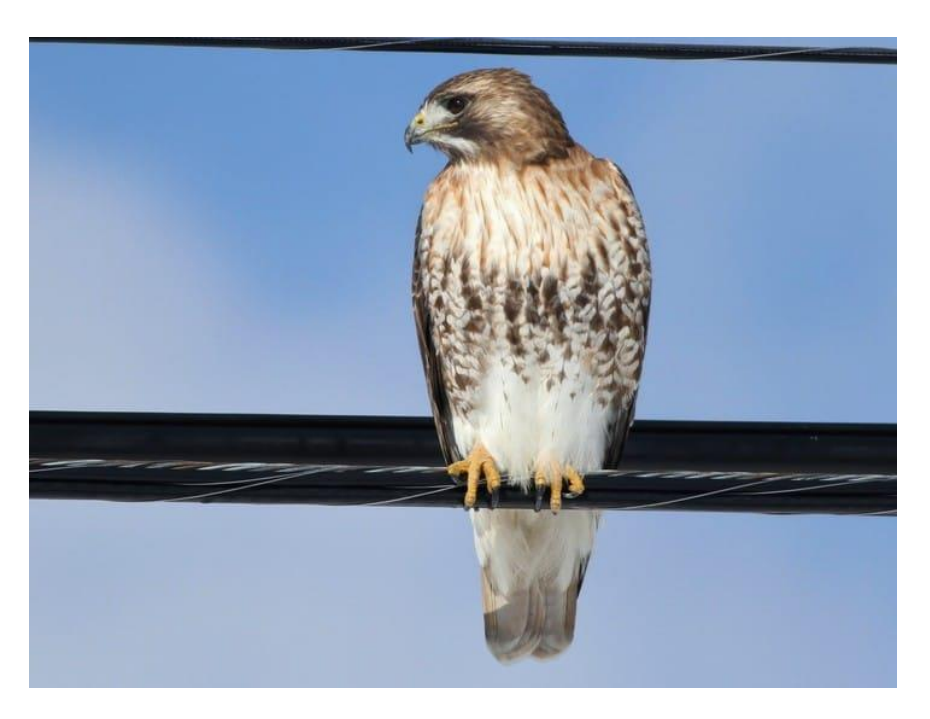
Red-tailed Hawk – Lamoreaux, Alex, 2016, Adult (borealis), The Cornell Lab of Ornithology, Ithaca, New York, accessed 15 March 2021, <a href="https://www.allaboutbirds.org/guide/Red-tailed_Hawk/media-browser-overview/60384771">https://www.allaboutbirds.org/guide/Red-tailed_Hawk/media-browser-overview/60384771</a>