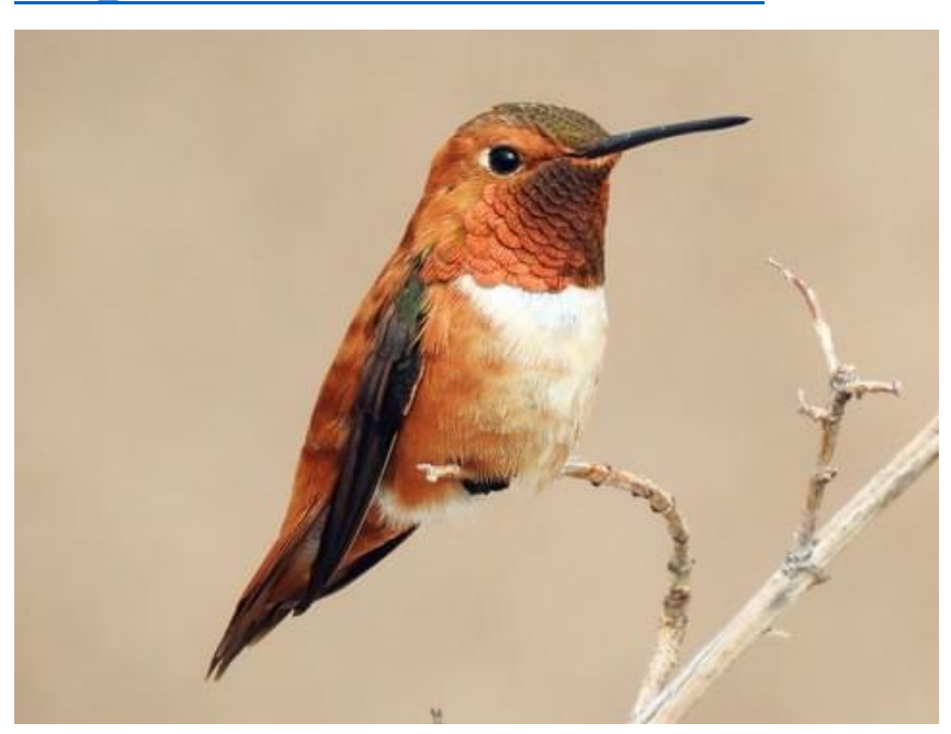
Rufous Hummingbird – Follett, Spencer, 2017, Adult male, The Cornell Lab of Ornithology, Ithaca, New York, accessed 15 March 2021,

https://www.allaboutbirds.org/guide/Rufous_Hummingbird/media-browser-overview/68934031